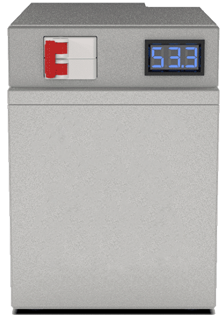
Mpower 1500 Battery